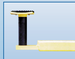
Stackable 3" and 6 ½" adapters