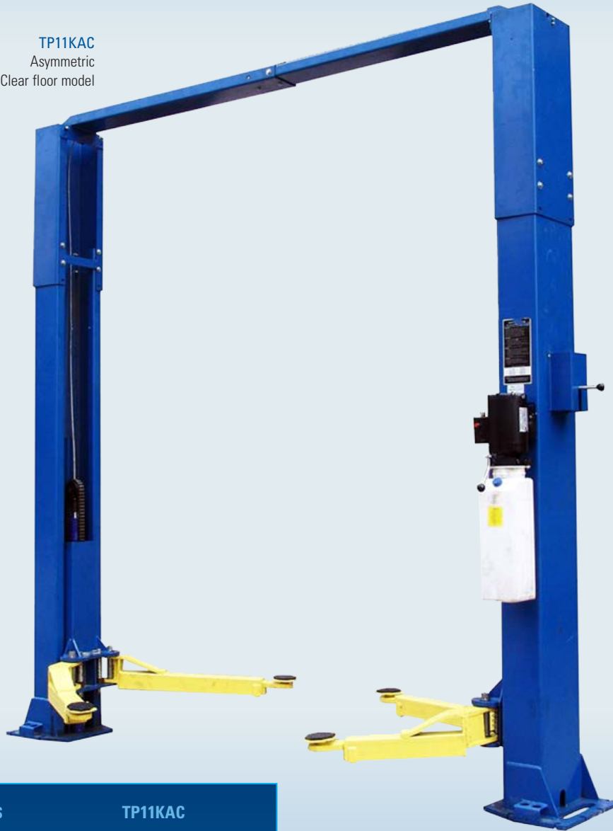
TP11KAC Asymmetric Clear floor model

A 11,000 lb. capacity two post asymmetric clear floor style lift featuring adjustable overall height to fit in more service bays and a single point safety release for easy lowering.